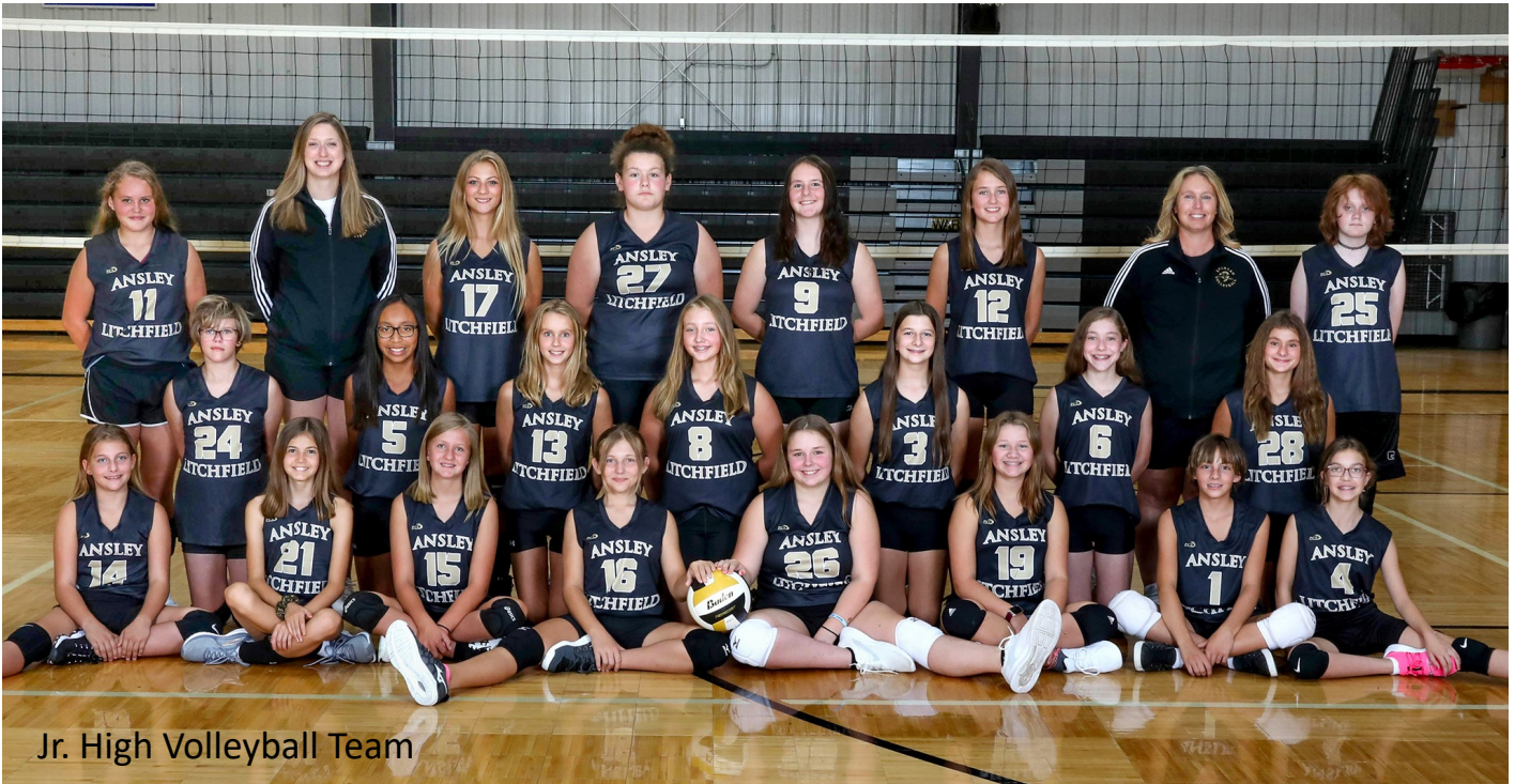
Jr. High Volleyball Team