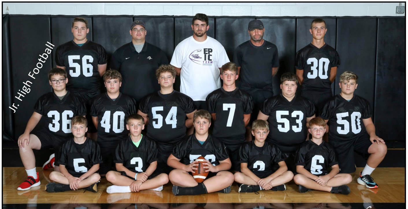
Jr. High Football